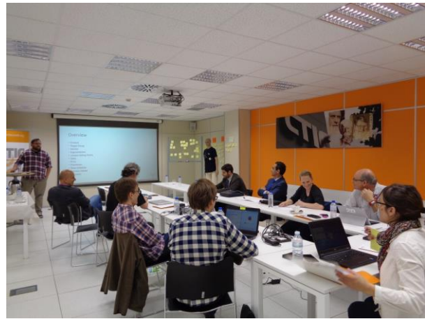
Figure 2: ELF@Home team at the meeting